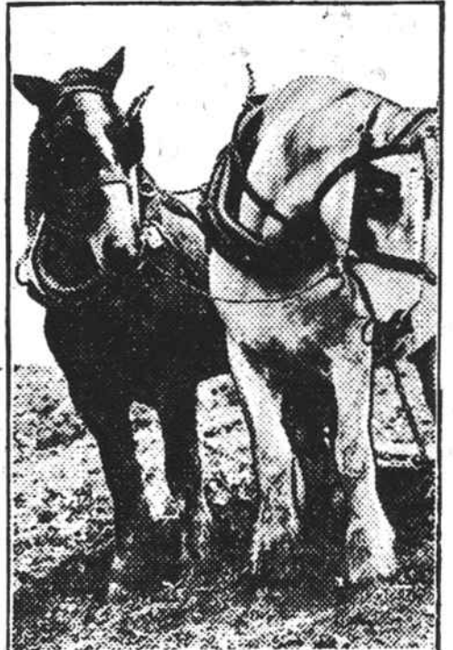
Where Horses Are Being Worked Hard the Amount of Grain Should Be Increased.

In the experiments referred to in the foregoing grain and hay were fed in quantities readily consumed by the animals. The grain fed in the first three experiments consisted of two-thirds corn and one-third oats, and in the fourth experiment of ear corn. In the first experiment clover hay was fed. In the second one-half clover and