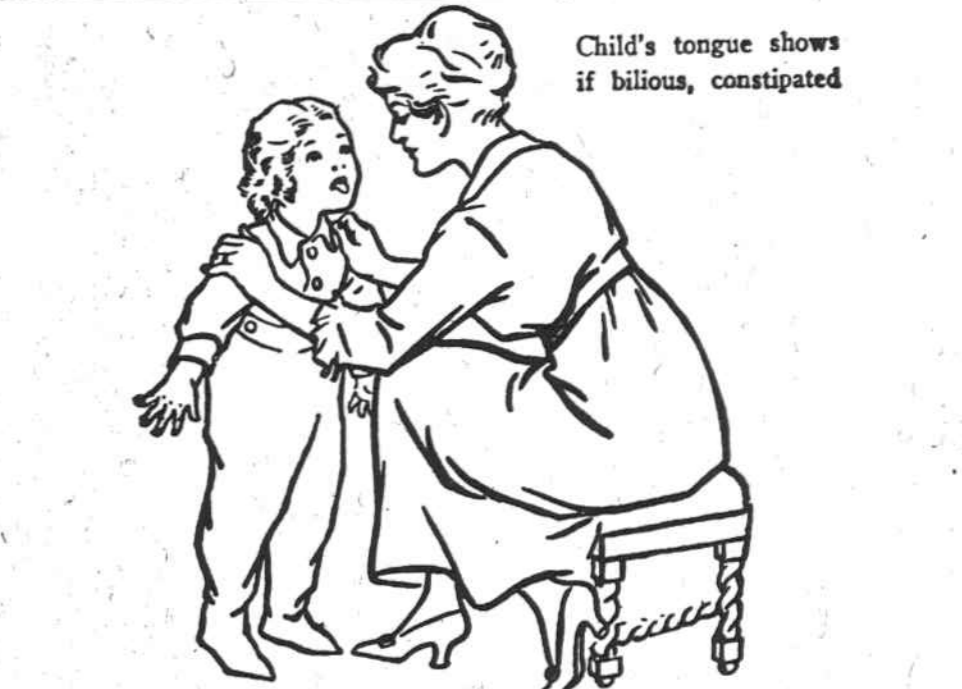
Child's tongue shows if bilious, constipated

you longer—try Dr. King's New Discovery—a good old family cough remedy, used for over half a century. The safest syrup for children. You get prompt, cooling, soothing relief from Dr. King's New Discovery. All druggists have it.