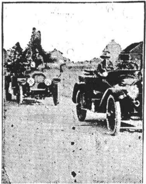
Fire Apparatus on Hard Road in Country.

Dallas county, Texas, has made it possible for the rural districts to obtain protection from the fire department in Dallas through the construction of modern hard-surfaced highways. A contract executed recently between the Dallas City commission and the county commissioners provides for fire protection to farmers on all paved roads within a radius of 15 miles of Dallas. When a farmhouse or barn along a paved road catches fire all the farmer has to do is to telephone the Dallas department and it