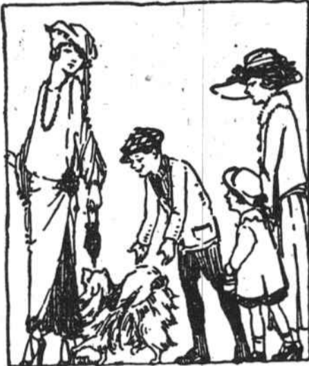
"A Little Dog."

Old Man Weather was much amused. He was around, of course. He always is around. He has such a lot of business to attend to at all times! He saw a little dog running along a street, getting out of the way of people, going to play with some other dogs who lived further down the street. The little dog knew just where he was going, oh yes, he didn't need to be told. He knew just as though he were a boy going off to play with some of his companions. No one need tell him the way. He knew! Old Man Weather watched him and as he watched him Old Man Weather almost forgot about his business for the moment. Although he has such a lot of business to attend to still he does rest a bit at times. It is then that people find Old Man Weather so undecided about what he is going to do next. Well, after the little dog had gone on, Old Man Weather began to think of his business affairs, and it was then that he was so amused. Of course he knew that there were big weather bureaus where they studied the Wind and the Clouds and the Sun and the condition of the At-