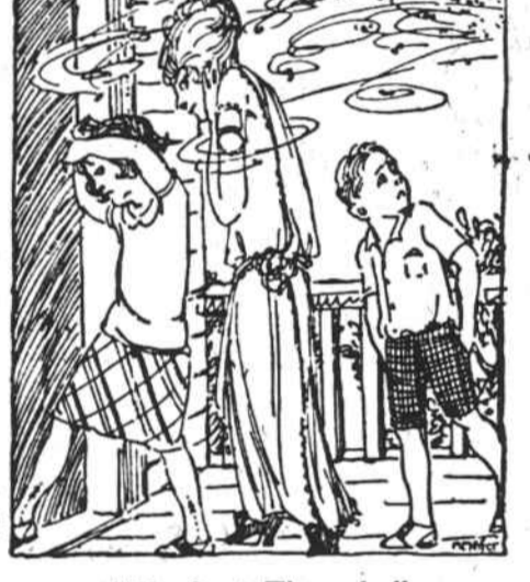
"We Sent Them In."

"The mosquitoes will not be kind. No, our pleasures in life, as you have said, Miss Mosquito, are in being just as mean as we can be. How well I remember the time some of us drove some people into a hot house from a cool porch. They had suffered terri-