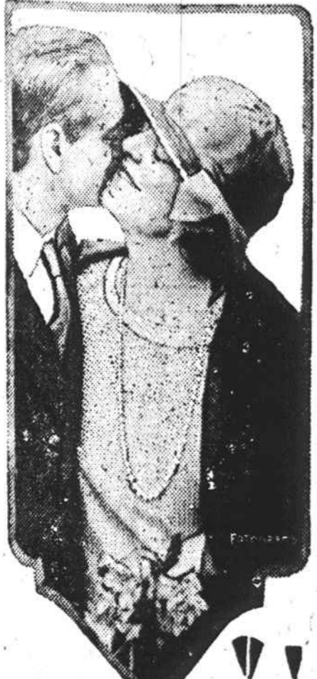
Ethel Barrymore kissing Brother Lionel good-bye as he sailed for Europe.