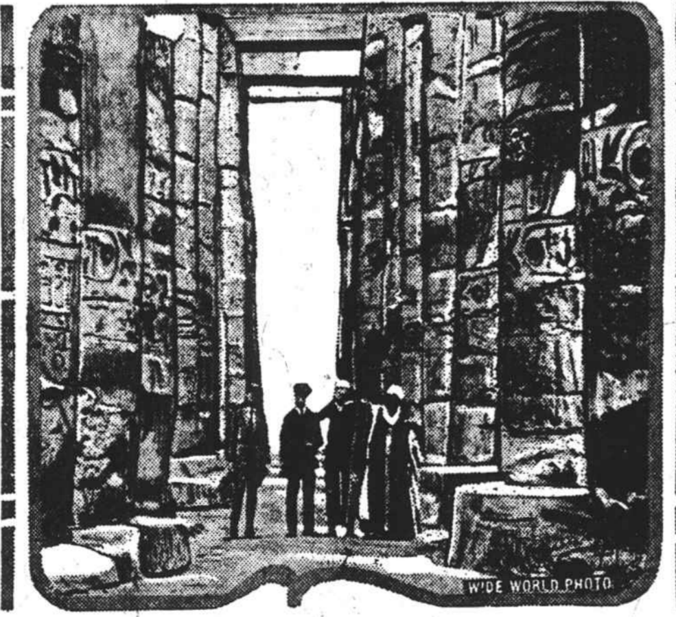
Bluejackets from the United States Destroyer Fox view the wonders of ancient Egypt. Photograph shows two of the sailor men in Hypostyle hall in the temple of Amnon at Karnak.