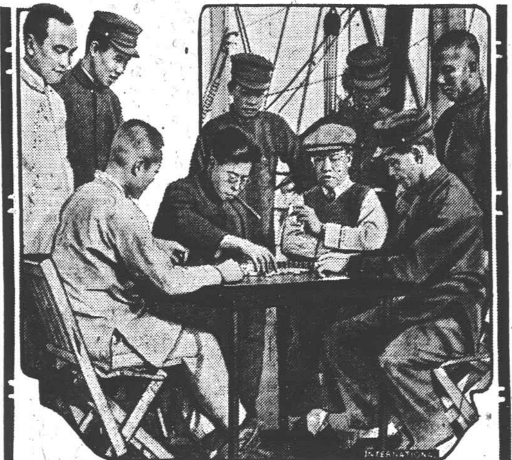
It has often been said by humorists that the Chinese do not know the new popular Chinese game of mah jongg. Proof to the contrary is furnished by this photograph of the Chinese members of the steamship President Lincoln engaging in the game in their leisure time.