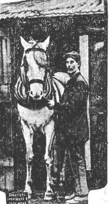
This beautiful cream-colored horse was once one of the famous team which drew the royal coach containing the king and queen of England at the opening of parliament and on other state occasions. As a measure of economy the team was dispersed in 1921 and now this once proud prancer is used to draw a cart on a golf course near London, lugging fresh sand for tees and turf to replace divots.