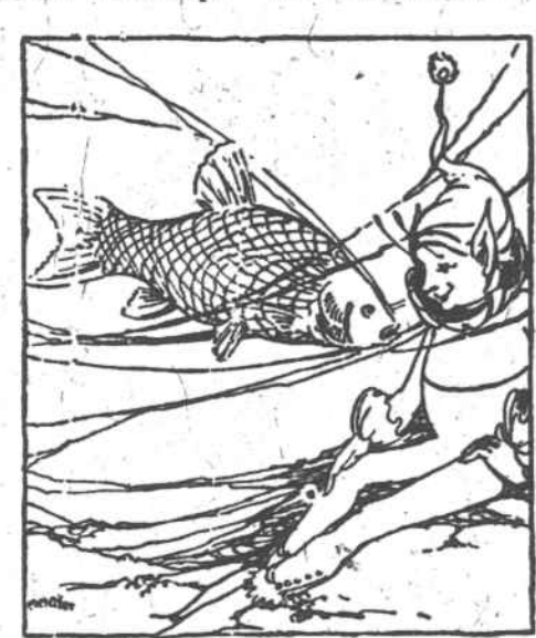
"You Will Please Me Greatly."

"Bnt we are strong, and we can stand hardship. We don't mind it if