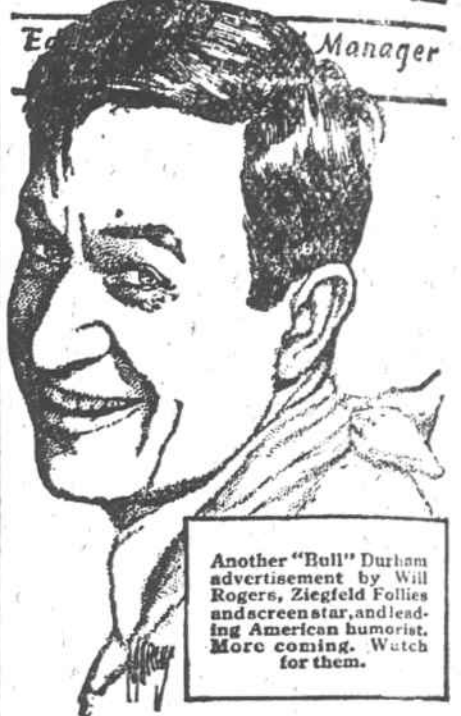
Another "Bull" Durham advertisement by Will Rogers, Ziegfeld Follies and screen star and leading American humorist. More coming. Watch for them.