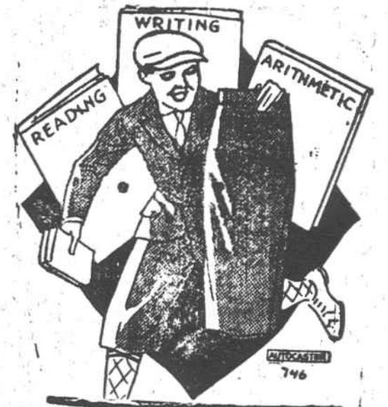
TWO PAIR TROUSERS

Here are suit values for boys which will meet the immediate approval of both wearers and parents, because they combine both style and quality, plus low price and to be had in a variety of patterns which offer wide selection. There are two-trouser suits four piece, which includes a vest; some with one pair of knickers and one pair of long trousers. They will stand the hard test of school and play ground and look good all the time.