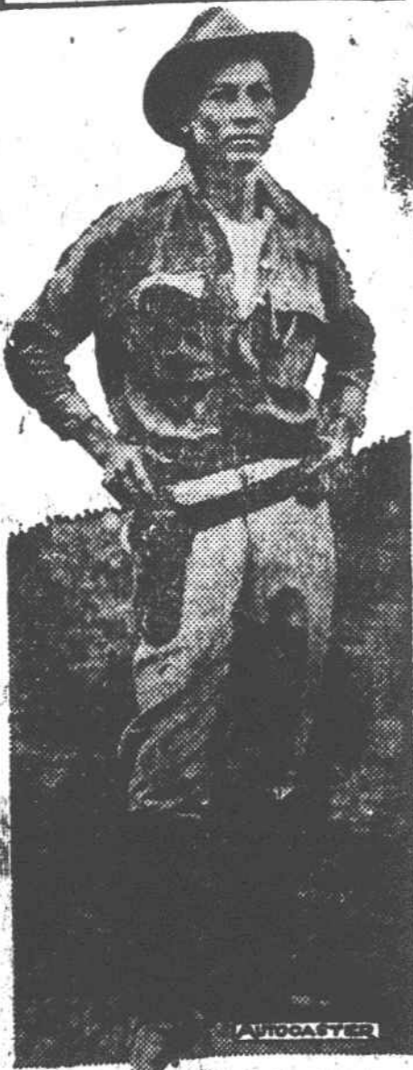
A recent snap shot, just received at Marine Corps Headquarters, of General Augustino Sandino, leader of the revolutionists in Nicaragua. A number of marines have lost their lives in battles with the native troops under General Sandino.

One of the best flocks of poultry in Cabarrus county is kept in a house made of sacks with straw loft. The house cost $25 and will take care of 250 birds. The straw loft gives protection from heat and cold.