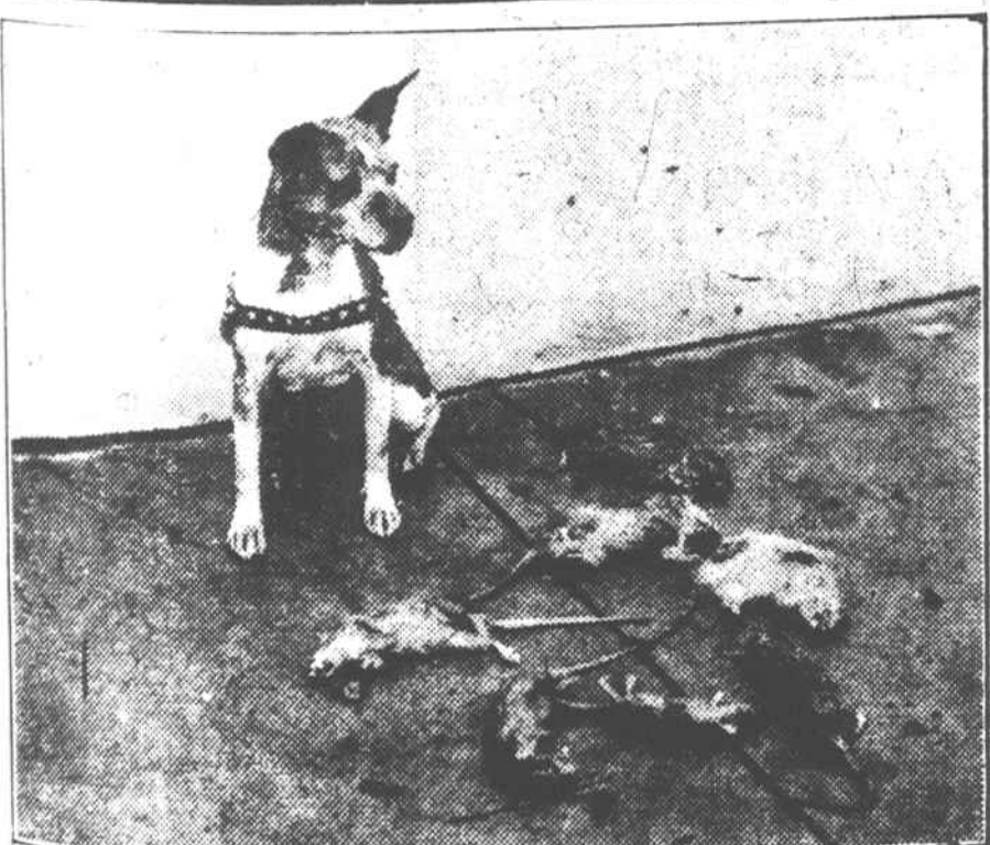
SET THE DOG ON HIM—DRIVE HIM OUT!