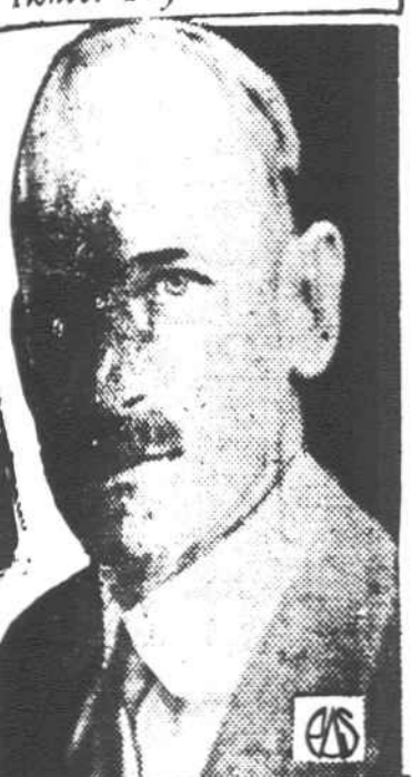
Glenn H. Curtiss, first man in the world to make a public flight in an airplane, whose work made flying practical.