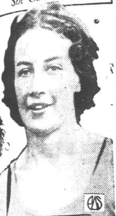
Joyce Cooper, English woman swimming champion, who has come to America to compete with woman swimmers here.