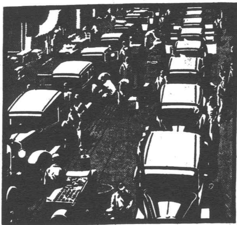
Modern production methods

50-horsepower six-cylinder motor . . . 48-pound crankshaft . . . full-length frame . . . four semi-elliptic springs . . . fully-enclosed four-wheel brakes . . . four Lovejoy hydraulic shock absorbers . . . dash gasoline gauge . . . Fisher hardwood-and-steel body . . . adjustable driver's seat . . . safety gasoline tank in the rear . . . non-glare VV windshield . . . and, for your protection, a new and liberal service policy.