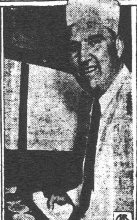
"Jess" Willard, one-time world's champion heavyweight boxer, now runs a food shop in Los Angeles.

Wheat Fertilizer, 200 pounds, 8.4.4 $2.95. Sylva Feed Company.