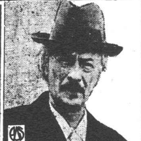
Ignatz Jan Paderewski, 70, once prime minister of Poland, the world's most famous pianist, returns to America for a concert tour.