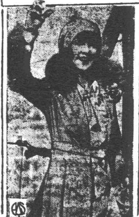
Fanny Ward, America's most youthful actress, who looks thirty or less, owns up that she was sixty years old last winter.