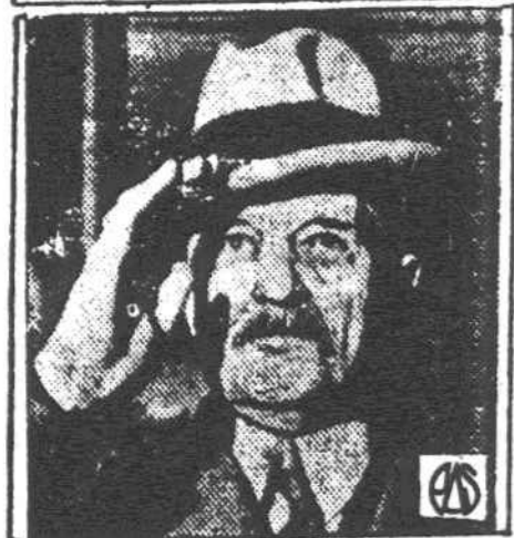
General John J. Pershing, photographed as he arrived at the national convention of the American Legion in Boston.