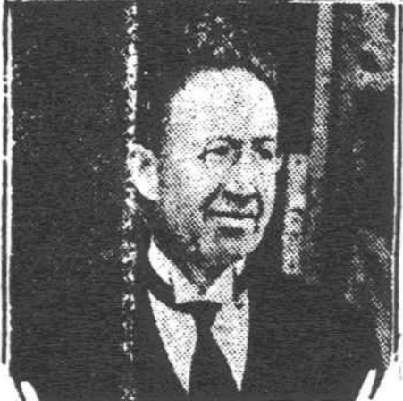
Rev. Harry Emerson Fosdick, minister of the new Riverside Church in New York, (undenominational) to hear whom thousands flock every Sunday.