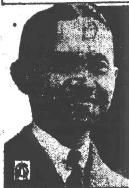
King Pradhipok of Siam is in this country to see an eye doctor.