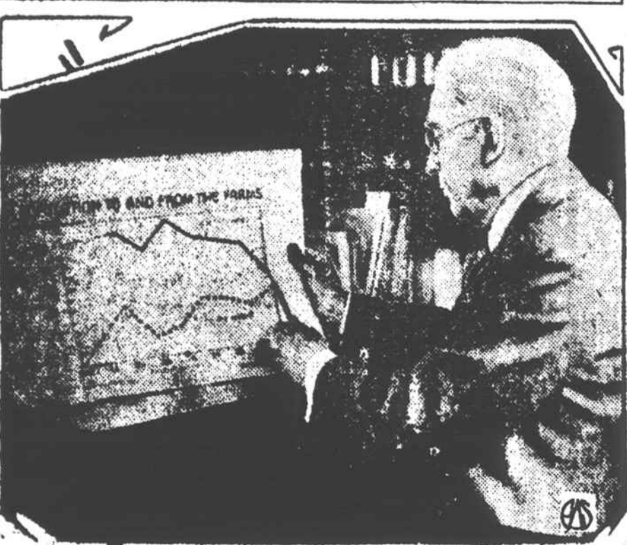
Chart Shows Farmers Grow in Numbers