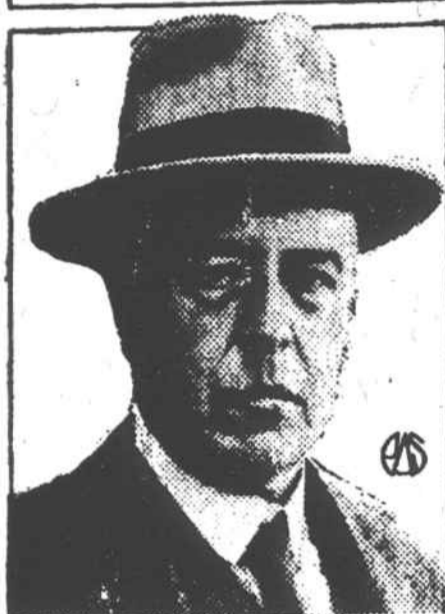
Sir James Jeans, astronomer, is here to peep through the Mount Wilson telescope.