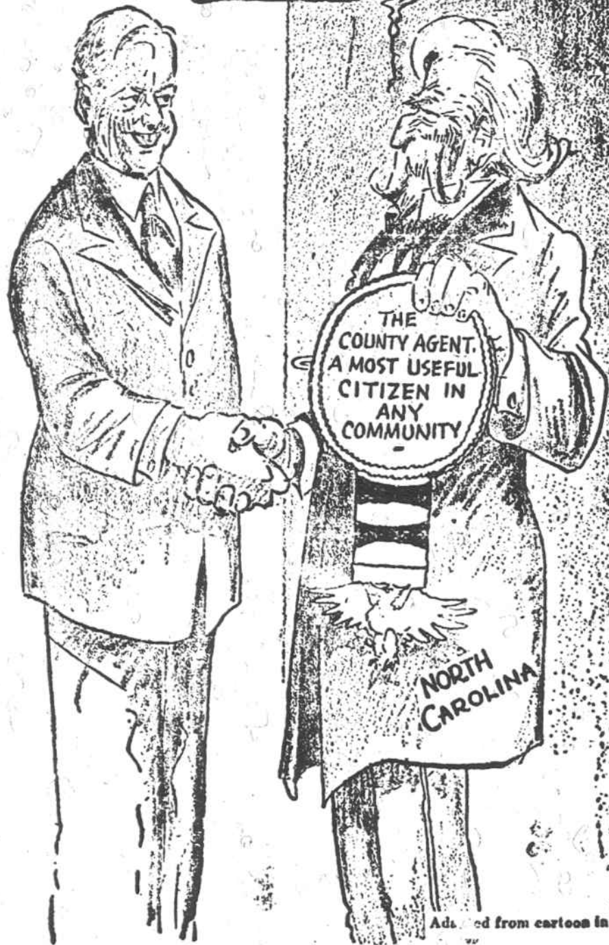
Adapted from cartoon in Nashville Banner