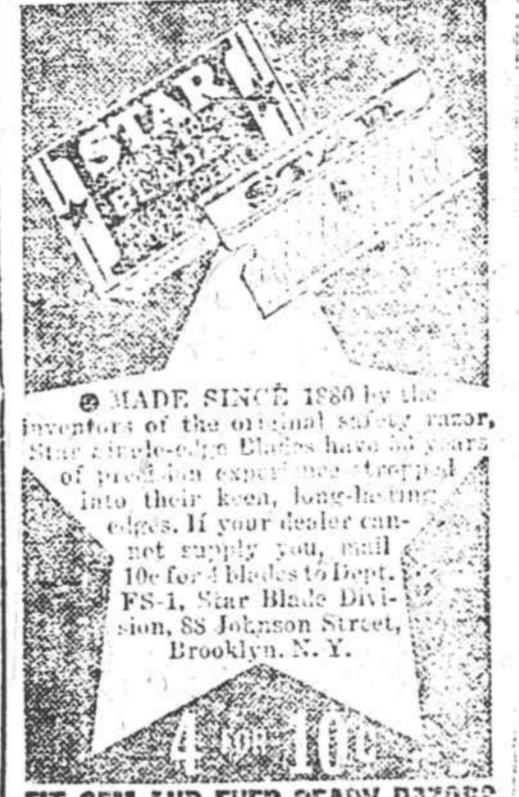
FIT GEM AND EVER-READY RAZORS