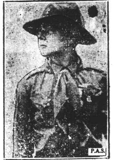
BUCHAREST, Rumania . . . Nazi influence threatens to engulf Czechoslovakia and Hungary, and European diplomats ponder the fate of Rumania lying athwart Hitler's path to the Soviet Ukraine—a path he has sworn to take. Above is Prince Michael, boy-king until his father, Carol, took over the throne. Will Michael wear the crown again?—or will he, like so many others, fall victim to relentless Fascist forces?

LAWN GRASS seed, lime, sheep manure, bone meal, peat moss. See about your lawn problems. FARMERS FEDERATION.