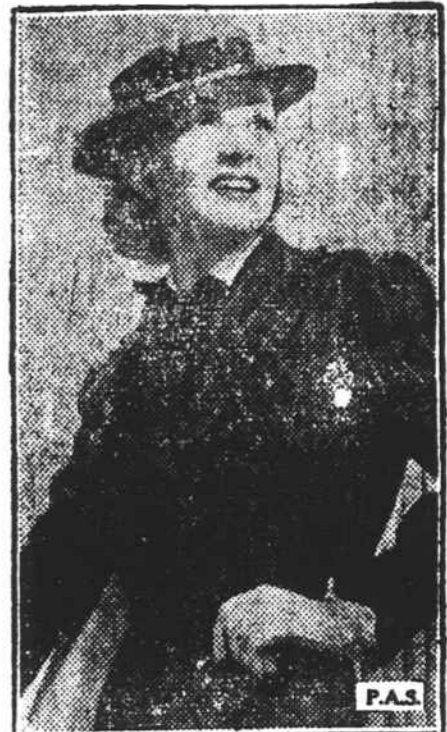
NEW YORK CITY . . . Feminine lines soften the mannish style of the long single-breasted coat in this chic outfit. It is of navy blue woolen with a wide, white hairline stripe. The navy frock underneath is of a plain sheer woolen with a trim white collar. A straw sailor with veil completes this spring ensemble.