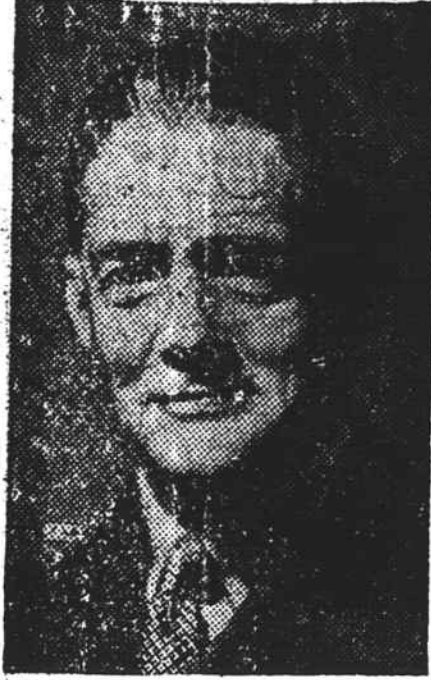
LONDON . . . The daring attempt, to kidnap Viscount Nuffield, wealthy British manufacturer from his office near Oxford by two men was frustrated by the quick action of a friend in a near-by office who notified the police when he overheard the men order Lord Nuffield to leave with them. Both of the would-be kidnapers were arrested.