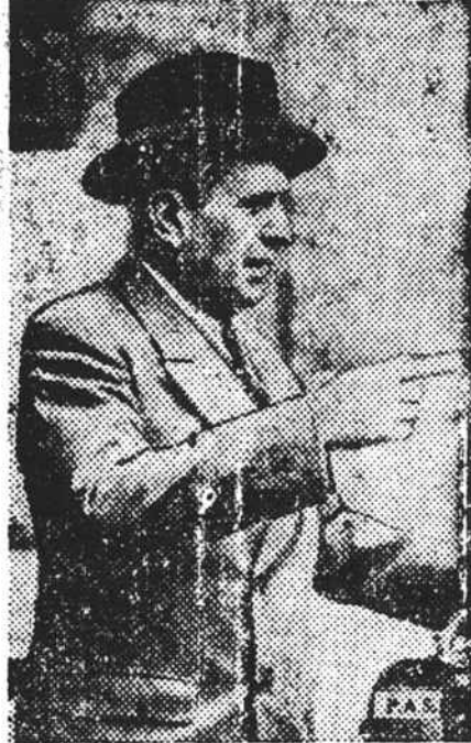
Jan Masaryk, the Czechoslovak Minister, shown leaving the British Foreign Office where he had been discussing the Czechoslovak Minorities question with Sir Alexander Cadogan. The Czech Minister's call came on the heels of Konrad Henlein's flying visit to London.