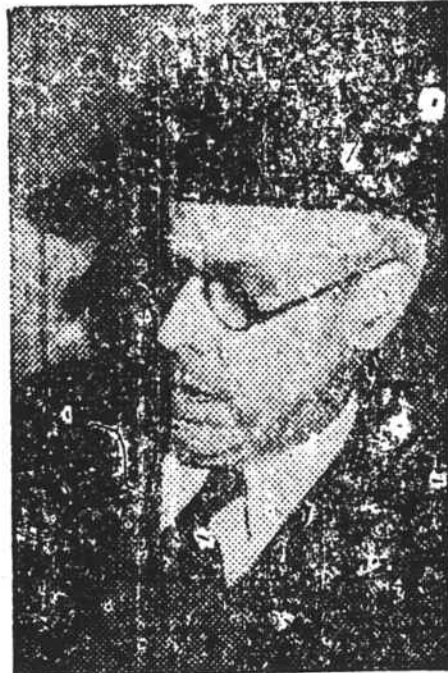
"I am the law" is the alleged boast of Frank Hague, "Boss" of New Jersey and of Jersey City. On the moment this would seem the truth for Norman Thomas, national Socialist leader and quadrennial presidential candidate, was ejected from the city twice for attempting to make a speech. Thomas (above) says he will contest Hague's action in suppressing free speech and in hustling him out of town against his will.