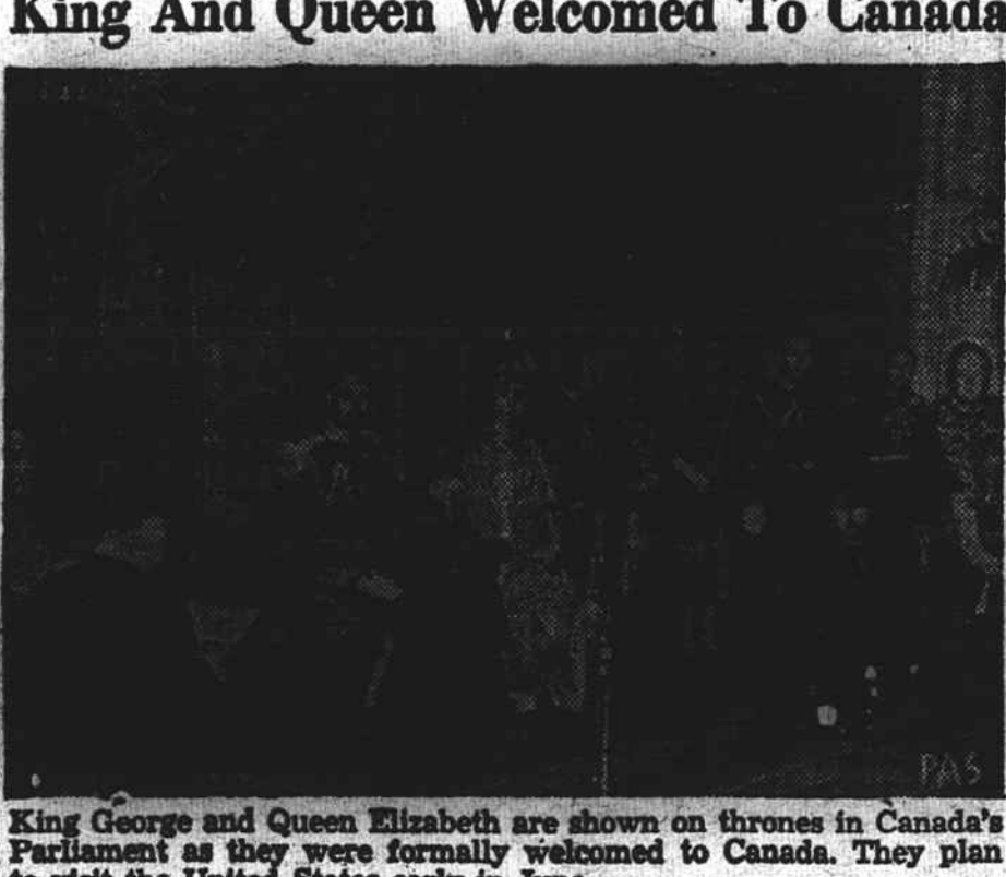
King George and Queen Elizabeth are shown on thrones in Canada's Parliament as they were formally welcomed to Canada. They plan to visit the United States early in June.