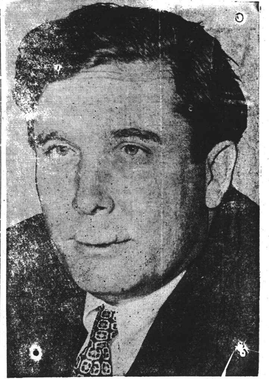
Wendell L. Willkie Republican Candidate For President

The planting of winter grazing crops is helping those mountain farmers who had their supply of hay washed away in the recent flood, report farm agents of the State College Extension Service.