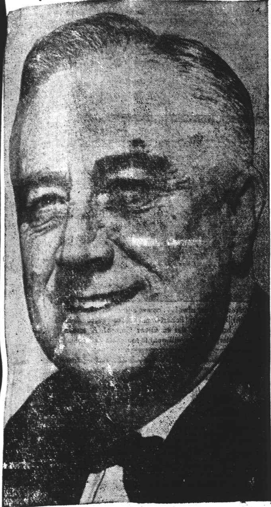
Franklin D. Roosevelt Democratic Candidate For President