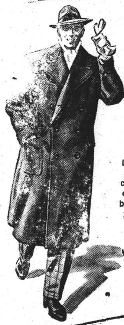
Double breasted camel hair coat, Black blue, or natural.