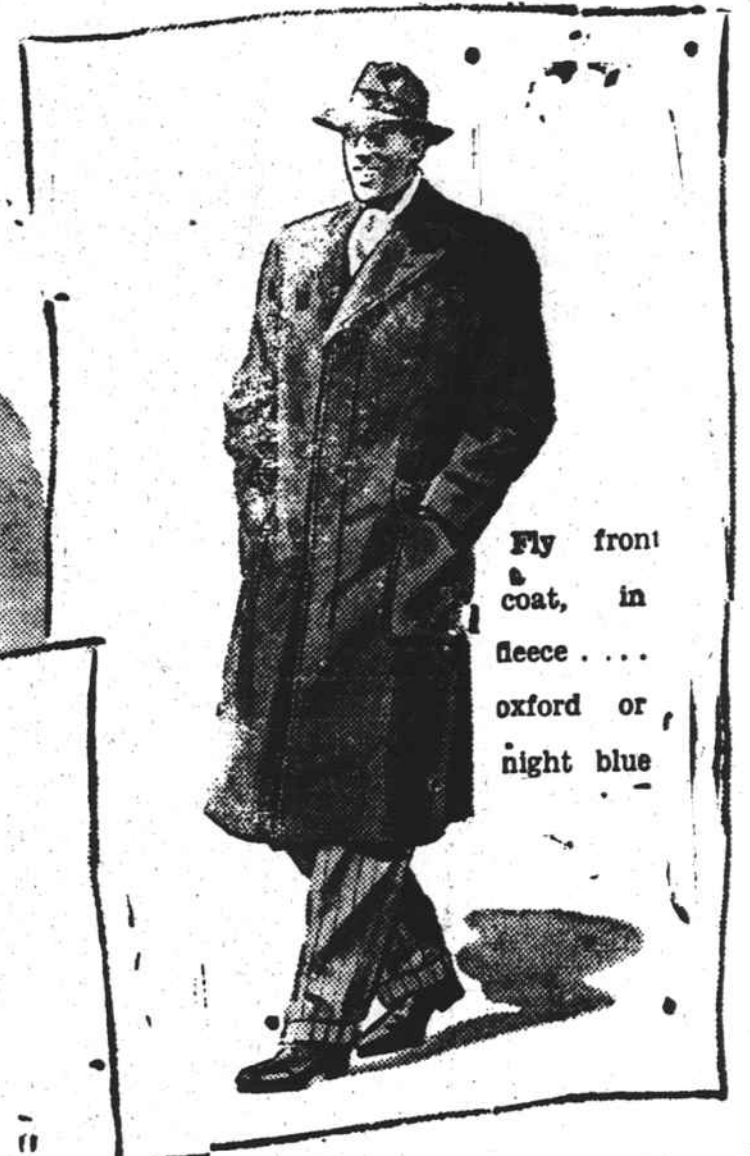
Fly front coat, in fleece... oxford or night blue