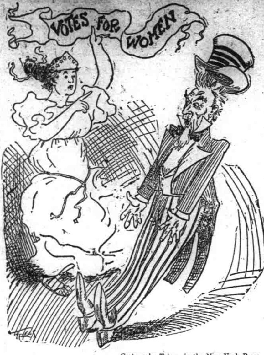
Uncle Sam—"Why, I thought it was all arranged that you were to stay at home and raise a large family!"