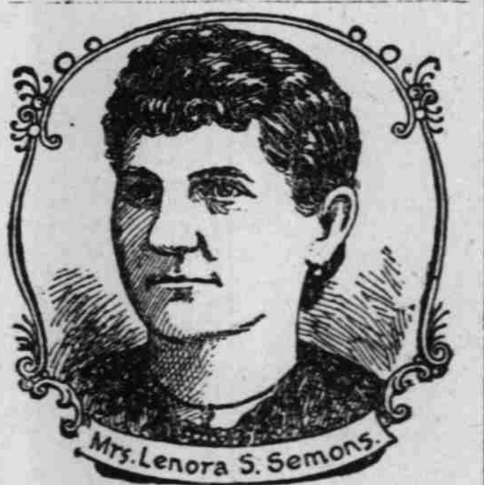
Salem, N. C.