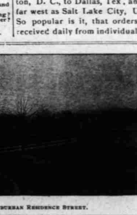
THE BURKE TANNING COMPANY