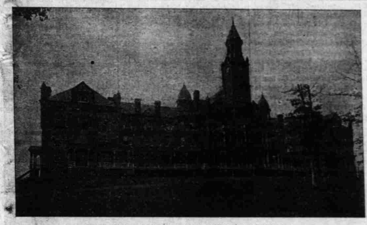
STATE SCHOOL FOR THE DEAF AND DUMB, MORGANTON, N. C.

face of the South Mountains in Burke. In the future this phenomenal section must become of inestimable value; for no where is there such certain assurance of the security and maturity of peaches and other tender fruit crops, or of the grape; to the successful cultivation of the grape the soil and the general conditions of the climate offer numerous inducements. The foregoing needs no comment, the intelligent reader readily understanding the many advantages possessed by such a section As to minerals, the county is ex-