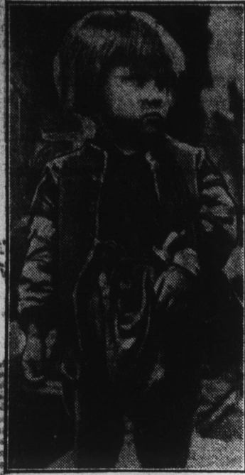
THIS LITTLE POLISH BOY knows about war at an age when in peace time he would have been knowing about fairy tales. He was orphaned during the Warsaw uprising, he was wounded, he doesn't even know his name. Now he is awaiting the food, clothing, and medicines which UNRRA is preparing to give him.