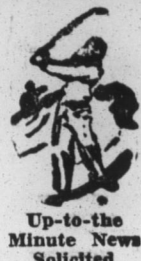
Up-to-the Minute News Solicited