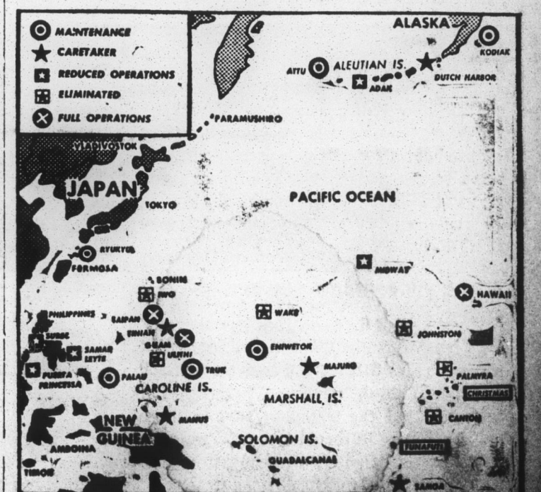
NAVY CURTAILING PACIFIC BASE PROGRAM... Finished by lack of personnel and scarcity of funds the navy now plans on maintaining only Guam and Saipan outside of Hawaii as a fully operational base. Wake, Iwo, Palmyra, Iwa, Johnston and Canton have been cut from the list of required bases. Legend at top left, indicates the status planned for the islands by the U. S. NAVY.