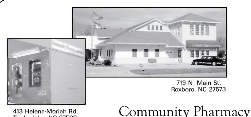
413 Helena-Moriah Rd. Timberlake, NC 27583

"I think it'll let me be independent more and pursue more of what I want," she commented, "as opposed to having restrictions and things like that."