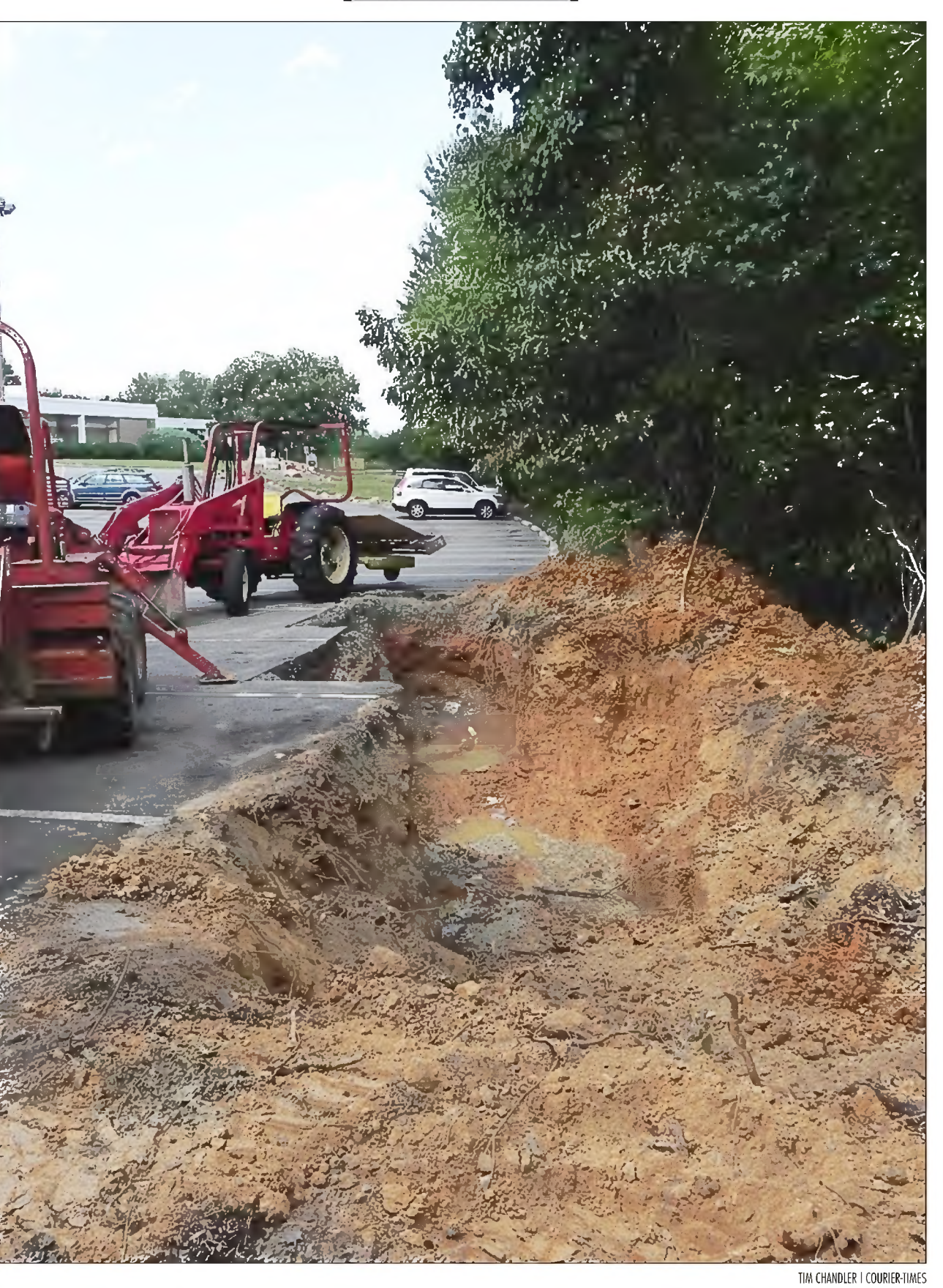
A water main break has caused havor this week at Piedmont Community College. Work continued on the problem area Tuesday. The water main break forced PCC officials to halt classes Monday at 1 p.m.