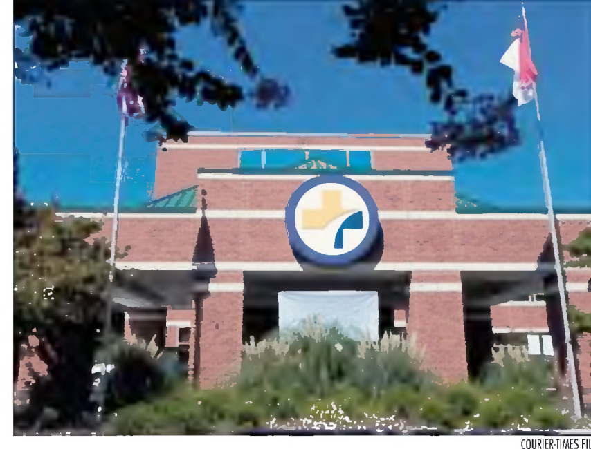
Duke LifePoint Healthcare signed a definitive agreement Friday to acquire Person Memorial Hospital.