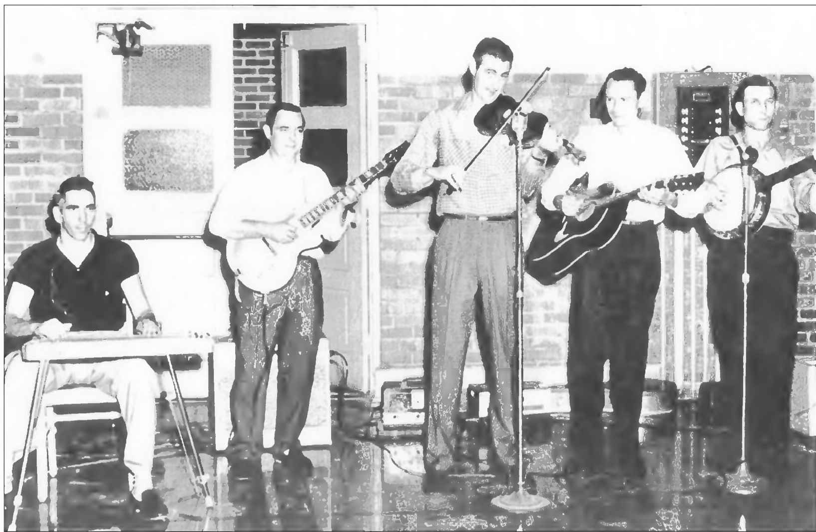
This week's photo was reportedly taken in the 1960s at Cavel School and features members of a band. Do you know the name of the band or the names of the members of the band? If you know some or all of the members of the band or if you know the name of the band, you can send your guesses via e-mail to tchandler@roxboro-courier.com . The names of the band members, along with the name of the band will be published in the Wednesday, Sept. 7, edition. If you have a photo you would like to submit, you can do so by sending it to the e-mail address listed above. Photos can also be mailed to The Courier-Times, P.O. Box 311, Roxboro, N.C., 27573 or they can be dropped off at The C-T office at 109 Clayton Ave.