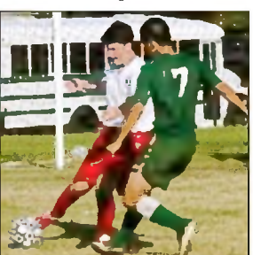
RCS SPORTS: Results of soccer, vollevball action from Roxboro Community School 🗛