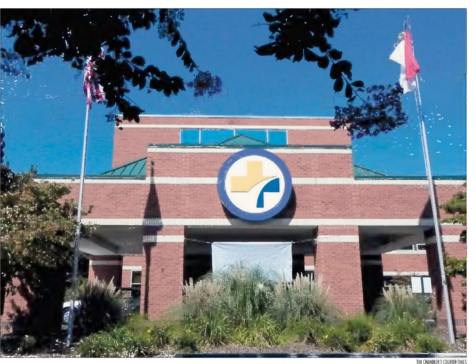
It was announced this week that Person Memorial Hospital has officially joined Duke LifePoint Healthcare.