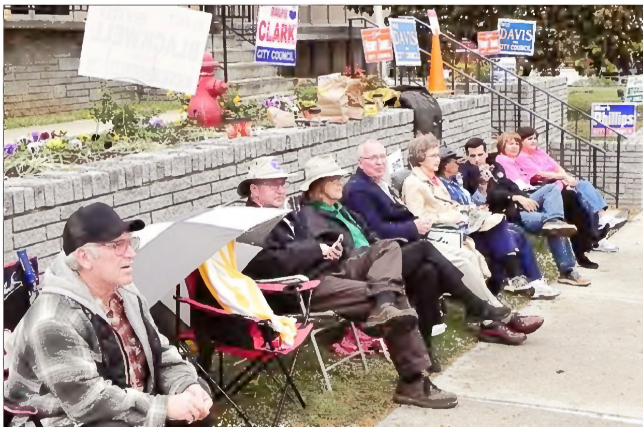
City council candidates and supporters work the polls during Tuesday's municipal election.