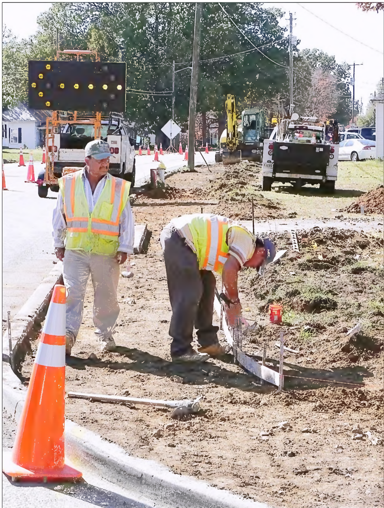
Crews were busy Tuesday afternoon working on a North Main Street sidewalk project. The project was made possible by a grant received by the City of Roxboro.