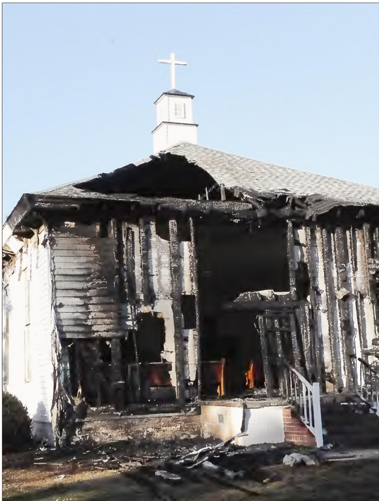
A Sunday afternoon fire caused major damage to Ephesus Baptist Church in Semora.