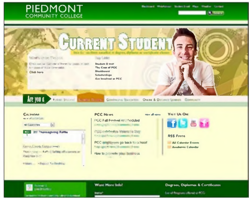
Piedmont Community College's award-winning Web site.