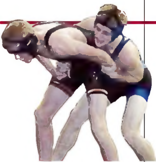
GRAPPLERS: Five Rocket wrestlers place at Orange Invitational; squad is 9th A6