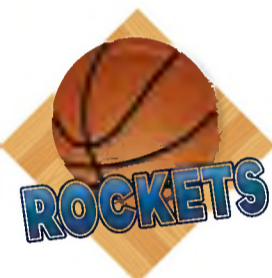
WINNERS? Find out if the Rocket basketball team claimed another victory over Webb A6