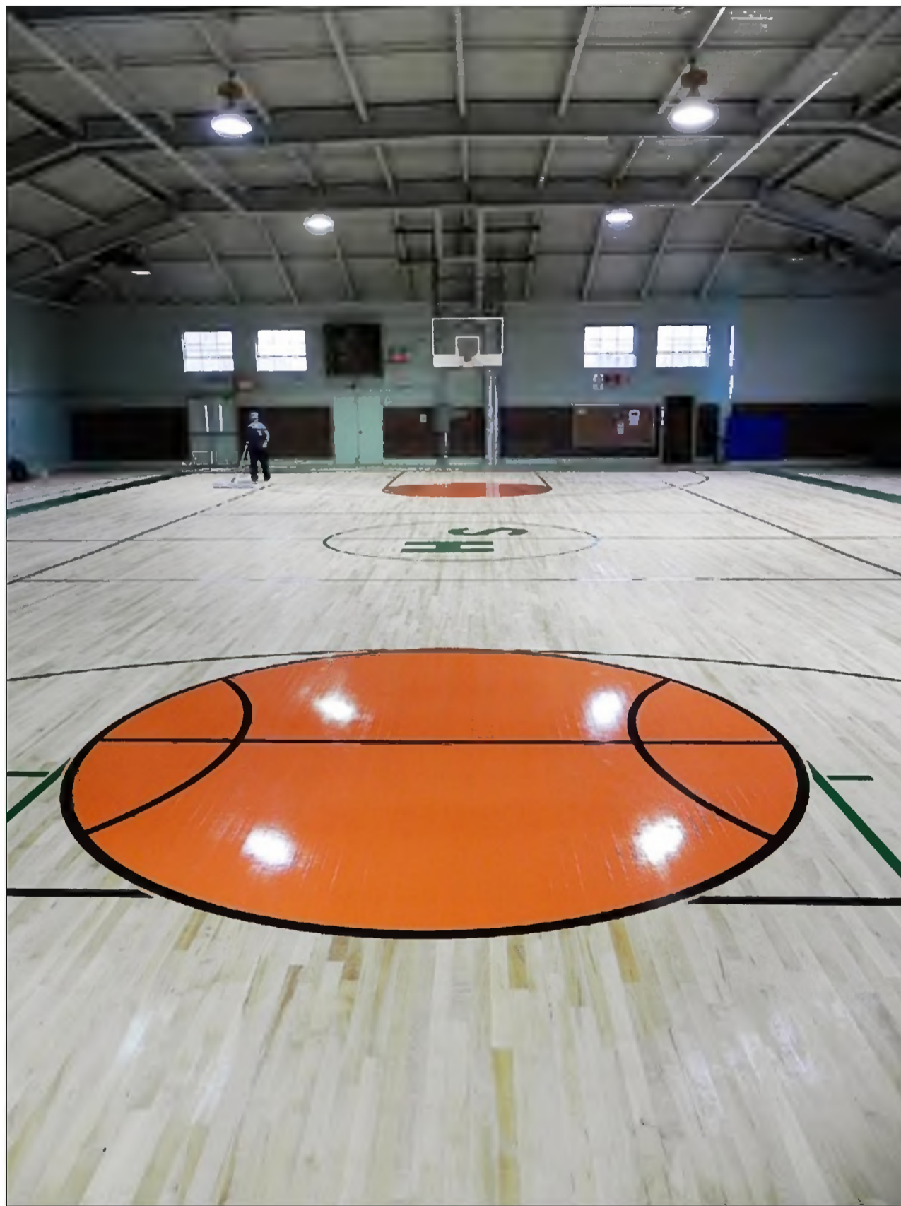
The newly refinished and redesigned gym floor at the Huck Sansbury Recreation Complex is pictured here in progress.