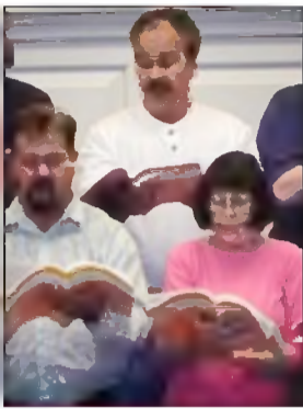
IT'S TIME: Community Choir of Person's holiday concert slated this week B1