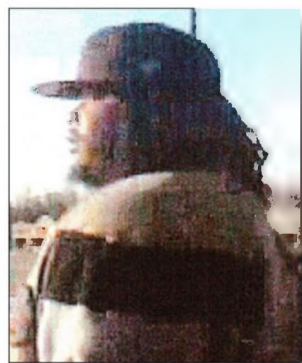
These two men are suspected of stealing electronics from Wal-Mart.