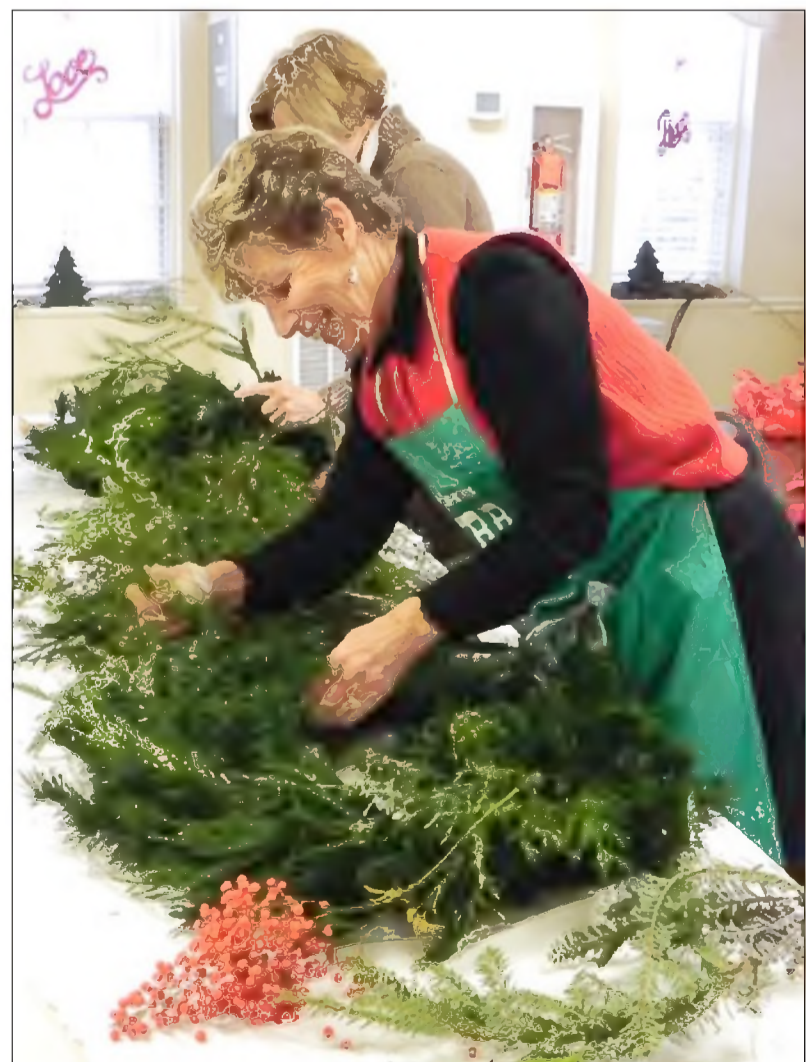
GREY PENTECOST | COURIER-TIMES