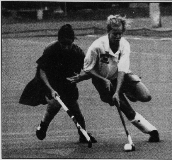
North Carolina won its first two ACC games this weekend. Sunday's 2-0 victory over Wake Forest was UNC's sixth consecutive shutout.

"We play both this team (Wake Forest) and Duke again this season, and we may meet them one more time in the ACC tournament," she said. "So we know we still have a lot of work to do."