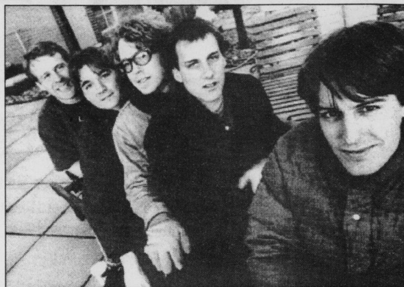
Pavement isn't letting a hectic tour schedule get in the way of a little fun.

No, not really. But I've heard good things about it.