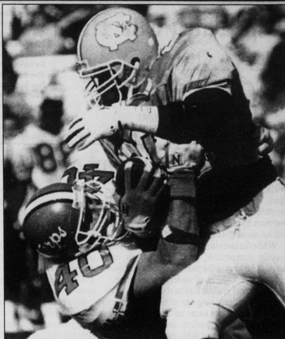
Natrone Means, shown here with his "mask" on, has exploded onto the NFL scene and will lead the San Diego Chargers into the Super Bowl Jan. 29.

Or on his quick NFL success: "I think other people are more surprised by it. I'm not. I felt if I could get the ball 20-25 times, I could put up some numbers. I feel like in order for us to be a success, the running game has to be successful, and that means me." Or on taking off his helmet to celebrate a 20-yard TD run, his longest of the year, in the regular-season finale against Pittsburgh: "I wanted to show everyone my face. I wanted to show them the man behind the mask." Means might not be a Jim Carrey, but he's certainly headed for stardom. He was a standout at UNC, rushing for more than 1,000 yards as a sophomore and junior before leaving school for the NFL. But Means wasn't taken in the first round of the draft, mainly because teams feared he had a weight problem. The Chargers had no such worries. Reasoning that Means was always heavy—he was 230 when he entered college—and wasn't slowed by it, San Diego traded its 1994 No. 1 choice to grab him. Although he fared well as Butts' backup in '93, the Natrone Bomb didn't go off until this season. "I never doubted myself," Means said with a smile and a puff on the cigar. "I always felt I could play here from the first day I got here."