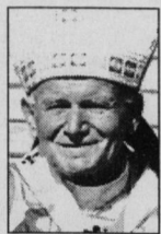
POPE JOHN PAUL II

"Every generation needs to know that freedom consists not in doing what we like but in having the right to do what we ought," John Paul said, warning of the dangers of a permissive society lacking a