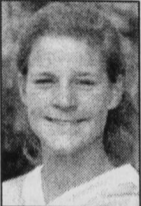
Freshman forward CINDY PARLOW is third in scoring for UNC with 30 points.