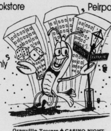
Granville Towers CASINO NIGHT

Antonio's Applebees Blockbuster (South Square) Blockbuster Music (University Mall) The Book Market Burt's Bees Inc. Camelot Music Cameron's Capital Travel Carolina Brewery Carolina Sports Cards Carolina University Bookstore Chapel Hill Florist Chick-fil-A Chilli's Circle Travel The Club for Women Only The Commons The Cotton Ball Dance Design Deck the Walls Fitness World Going Greek Great American Cookie Company Hair Plus Harrison House Apartments Illini Towers The Intimate Bookshop Jersey Mike's Jewel Box Knot Just Ties Lee's Chinese The Loop