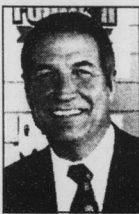
Alabama coach GENE STALLINGS will step down after the Crimson Tide's bowl game.