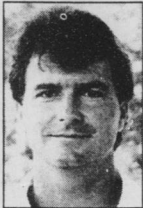
UNC coach ANSON DORRANCE said his program "sort of came from nowhere."

"If you look at the hut, it's not the most impressive building," Dorrance said Saturday after the Tar Heels beat Florida 9-0 to advance to the final four for the 15th consecutive year. "But if you look at the evolution of our program and of women's soccer, we sort of came from nowhere as well."