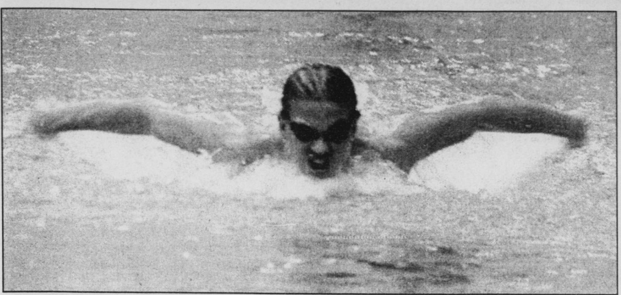
The North Carolina men's swimming and diving team placed 10 swimmers in four individual finals to race to first place in the ACC men's swimming championships. The event continues through Saturday at Koury Natatorium.